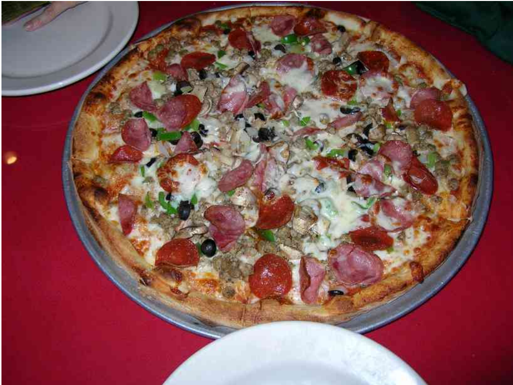
Frateli's Extra Large Supreme Pizza Shawnee, OK