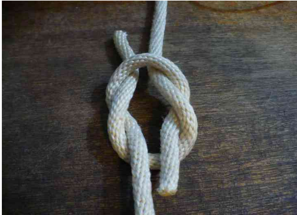
Thief's knot (from the internet)