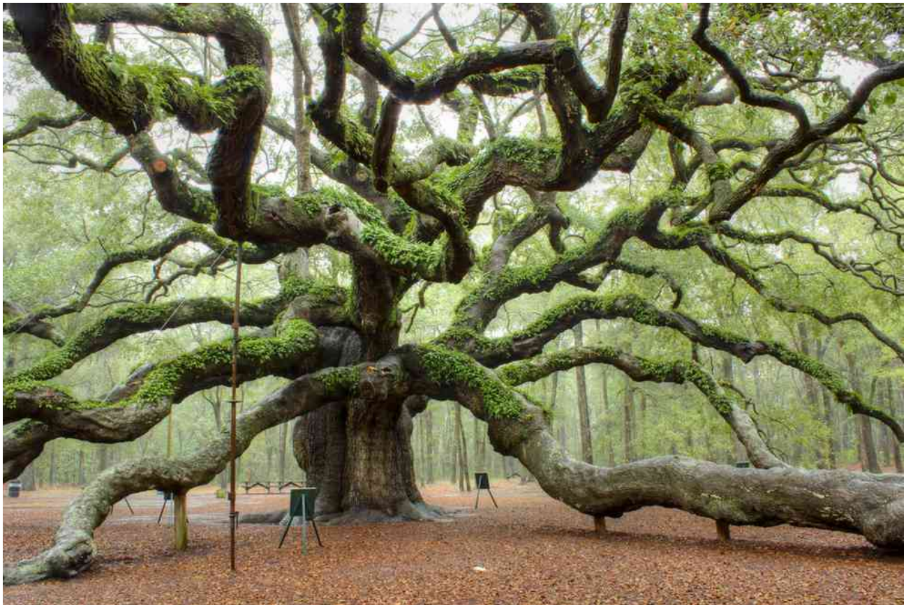
Angel Oak Tree, Charleston, South Carolina

Minutes for June's meeting will be in the August newsletter