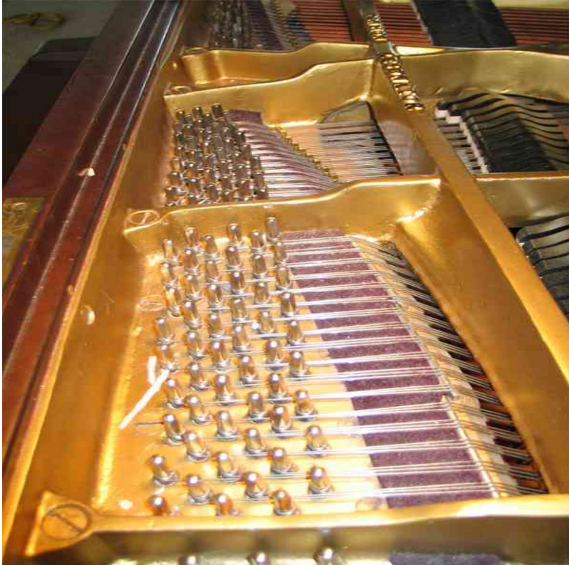
Tenor Before: Notice especially the low tenor angle.

Here are some before and after pictures of a M&H BB I rebuilt a couple years ago. The tuning pin webbing is so high relative to the string plane that the string angle between counterbearing bar and agraffe or capo are extreme. The plate is thick in this area so I did some grinding to decrease the angle. It is still difficult to tune this piano, but it is better now